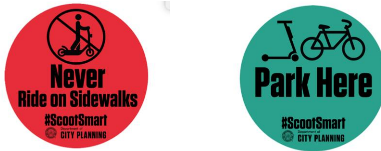
Examples of the e-scooter decals used in Atlanta (City of Atlanta, GA, 2019)

To educate and promote safe riding behavior, Atlanta created a #ScootSmart Campaign via social media and print to provide information on the new rules along with tips on how to ride and park safely. Decals posted around the city remind users of the prohibited sidewalk riding. “Park Here” stickers mark examples of dockless parking locations that leave space (at least 5 feet) for people walking and using wheelchairs. Riders must also park devices upright and not block walkways, doorways and ramps (City of Atlanta, GA, 2019).