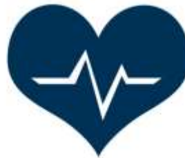
Community Support and Health Services