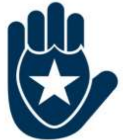
Elder Abuse, Neglect and Fraud