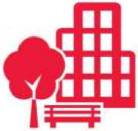
Outdoor Spaces and Buildings