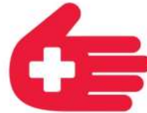
Emergency Preparedness and Resilience