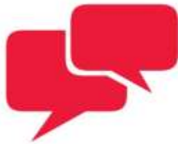
Communication and Information