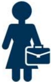
Civic Participation and Employment