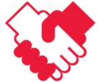
Respect and Social Inclusion